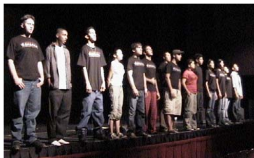
Students from five high schools attended a Theater Camp, held by the Theater & Communication Department in July. Three students received Theater Scholarships.