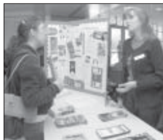
Above, more than 40 non-profit organizations participated in the Spring Service Learning & Volunteer Fair held Jan. 28.