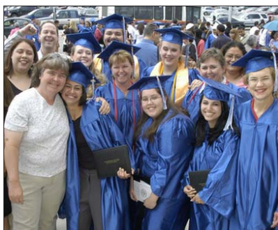
Faculty, staff and graduating students from the Interpreting for the Deaf department at SAC.