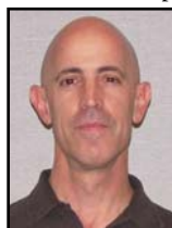
Berne Smith Visual Arts and Technology