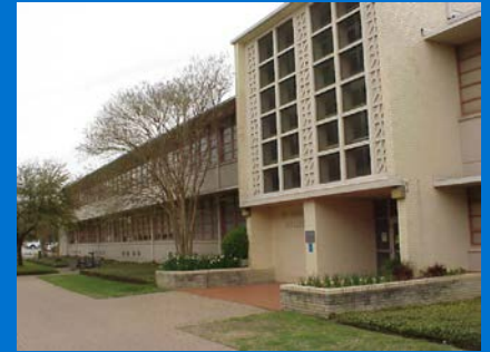
64-Year Old Bowden Building St. Philip's College, MLK Campus

The bond will address the rapid expansion of IT and Technology demand in the learning and student support enrollment area by funding ongoing infrastructure development.