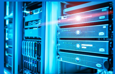
Technology Infrastructure for Enhanced Learning