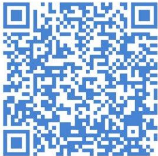
Texas Workforce Commission Outreach and Employer Initiatives