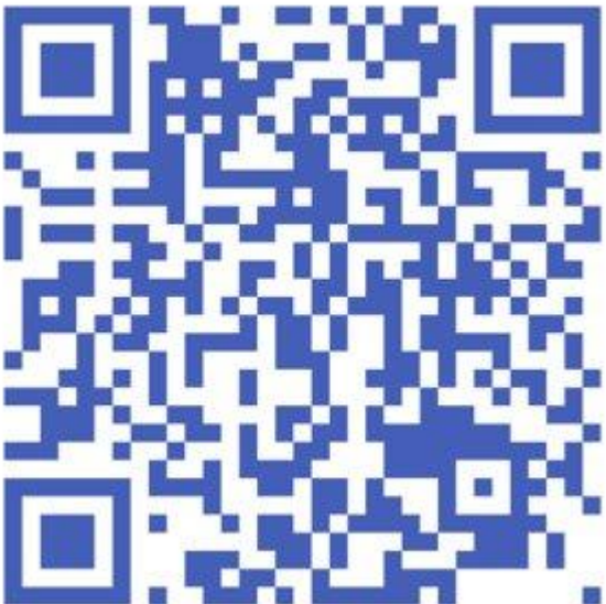
Skills Development Fund