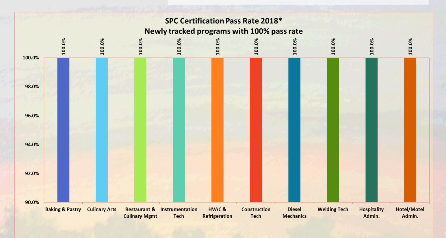
Figure 32-2 SPC certificate pass rates for 2018 as reported to THECB

As seen in Figure 32-2 (below), ten programs across Tourism, Hospitality and Culinary Arts, Transportation and Manufacturing Technologies, and Allied Construction Technology departments achieved 100% certification pass rates for academic year 2018.