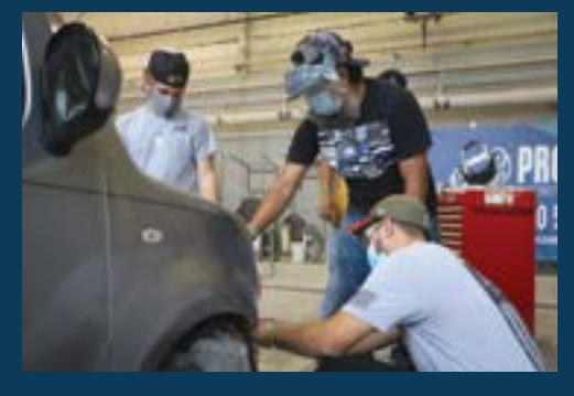
The Collision & Refinishing program incorporates hands-on training with all facets of collision repair on vehicles that have sustained damage in an actual collision, providing a real-world setting in which to learn.

Students from the St. Philip's College Collision & Refinishing Technician Program are applying their skills and knowledge to a good cause. During the Fall 2020 and Spring 2021 semesters, students will be refurbishing a Nissan Cube for a San Antonio community veteran. The vehicle was donated by ProCare Collision, a local body shop that helps donate refurbished cars to people in need through local programs.