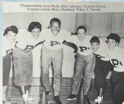
This 1954 yearbook photo captures student cheerleaders inside the college gymnasium.