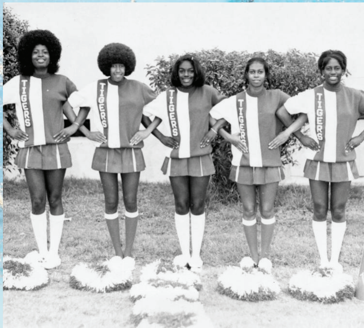
St. Philip's College student cheerleaders are pictured in this 1973 photograph.