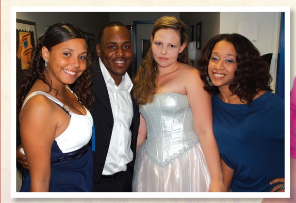
(Photo on left) Homecoming King and Queen canidates. (Photo on right) Azul performs at Southwest Campus.

Homecoming Features Alumni Mixer, Blue and White Dance Keeping October activity at a fast pace, St. Philip's College held a free family-friendly 2010 Homecoming weekend program for alumni, students, and friends of the college October 22–24. (See HH Month, Homecoming/page 5)