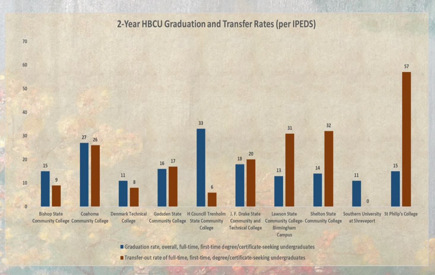
Figure 23-2: Graduation and transfer out rates of full time, first –time award-seeking students Data Source: Integrated Postsecondary Education Data System (IPEDS)

While St. Philip's College landed in the middle with a graduation rate of 15%, the transfer rate led HBCU peers at 57%, with the nearest, Shelton State Community College achieving a 32% transfer rate. The lowest (available) transfer rate occurred at H Council Trenholm State Community College (6%), where students produced the highest graduation rate with 33%. The lowest graduation rate (11%) occurred at two institutions: Denmark Technical College and Southern University at Shreveport, which showed no transfer rate in IPEDS.