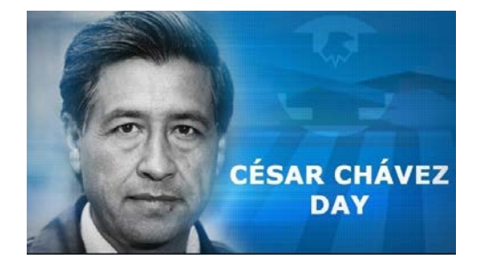
"The fight is never about grapes or lettuce. It is always about people."