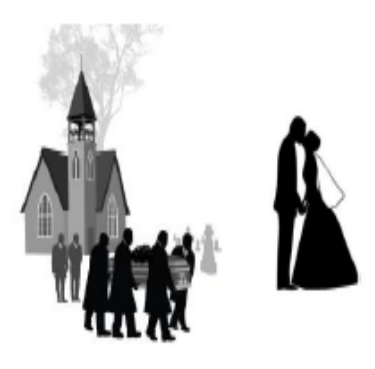
Religious or civil ceremonies or observances, such as funerals and weddings.