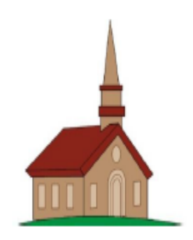
Places of worship, such as churches, synagogues, mosques, and temples.

Medical treatment and health care facilities, such as hospitals, doctors' offices, accredited health clinics, and emergent or urgent care facilities.