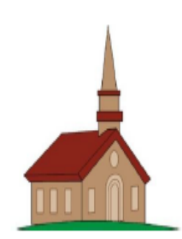
Places of worship, such as churches, synagogues, mosques, and temples.