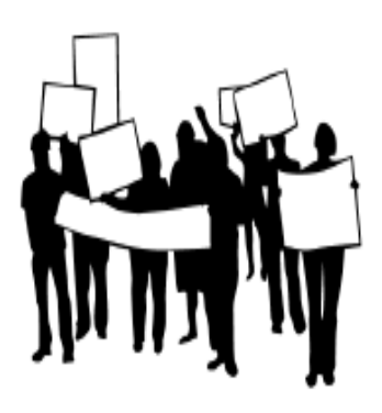
During public demonstrations, such as a march, rally, or parade.