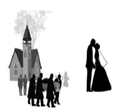
Religious or civil ceremonies or observances, such as funerals and weddings.