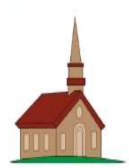
Places of worship, such as churches, synagogues, mosques, and temples.