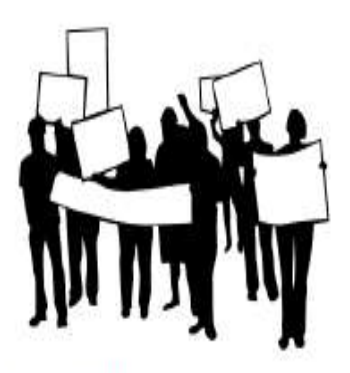
During public demonstrations, such as a march, rally, or parade.