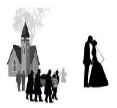
Religious or civil ceremonies or observances, such as funerals and weddings.