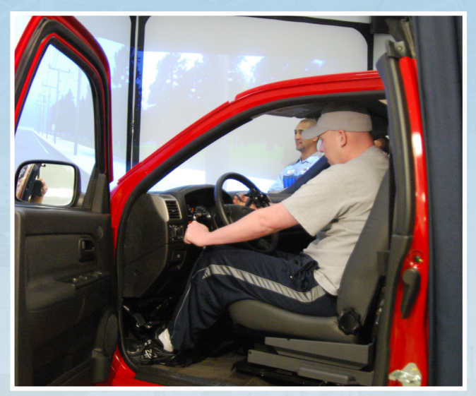
Wounded warrior demonstrates driving simulator.

The vehicle, a 2008 Colorado pick-up truck donated by