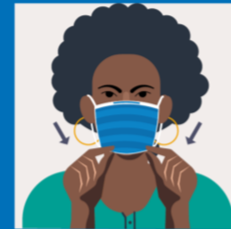
STRETCH THE MASK TO OVER YOUR CHIN