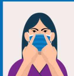
FIX THE MASK TO FIT THE SHAPE OF YOUR NOSE