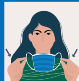
REMOVE THE MASK FROM BEHIND BY HOLDING THE STRINGS WITH YOUR HANDS