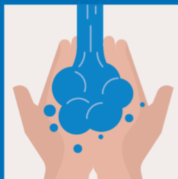
WASH YOUR HANDS BEFORE REMOVING YOUR MASK