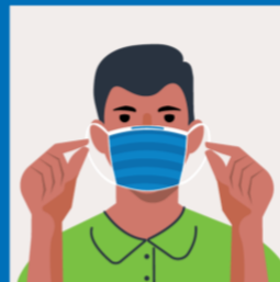
SECURE THE STRINGS AROUND YOUR EARS