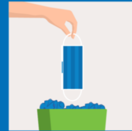
DISPOSABLE MASKS SHOULD BE PLACED IN THE TRASH. CLOTH MASKS SHOULD BE WASHED PRIOR TO REUSE.