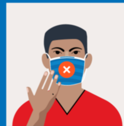
DO NOT TOUCH THE MASK WHILE USING IT