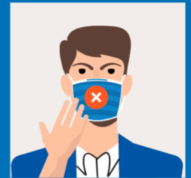
DO NOT TOUCH THE MASK WHILE USING IT