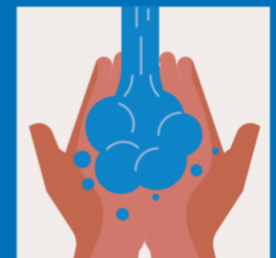
WASH YOUR HANDS AFTER REMOVING YOUR MASK