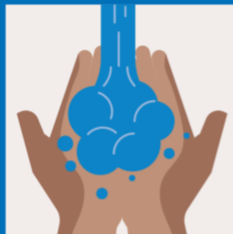
WASH YOUR HANDS BEFORE WEARING YOUR MASK

The Alamo Colleges District requires all students, staff and faculty to wear a face covering and mask while on campus to ensure the safest possible environment.