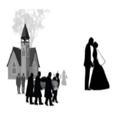
Religious or civil ceremonies or observances, such as funerals and weddings.