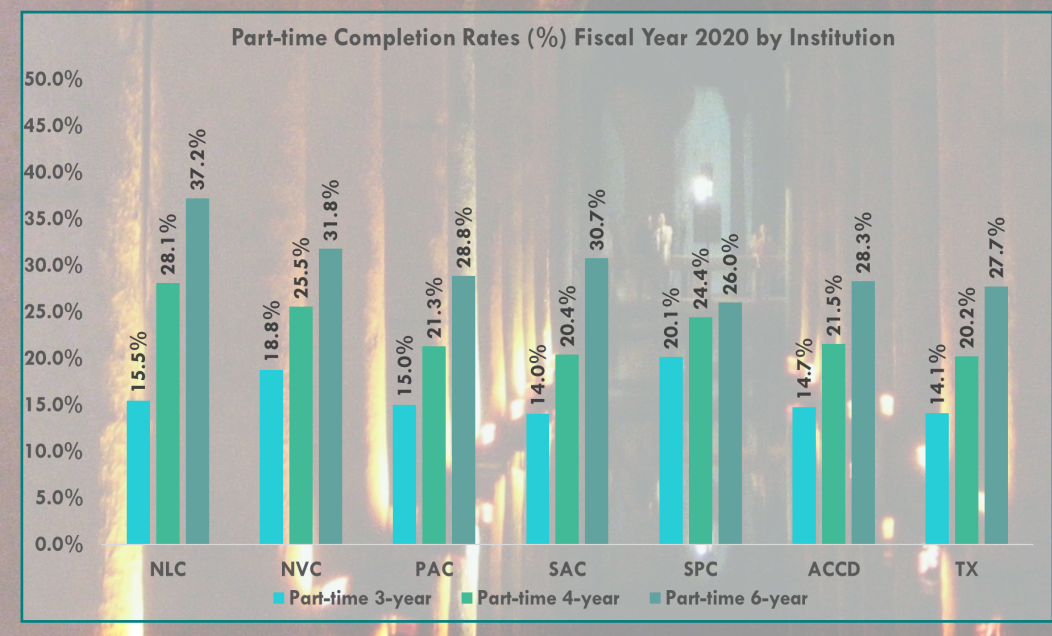
Figure 59-2 3-, 4-, and 6-year graduation rates for students enrolled part-time Data Source: THECB

Figure 59-1 3-, 4-, and 6-year graduation rates for students enrolled full-time Data Source: Texas Higher Education Coordinating Board (THECB)