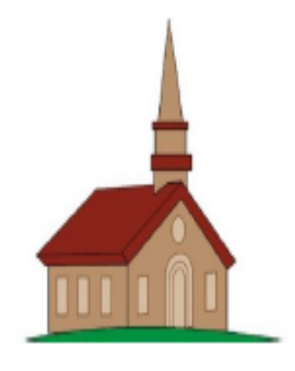
Places of worship, such as churches, synagogues, mosques, and temples.

Medical treatment and health care facilities, such as hospitals, doctors' offices, accredited health clinics, and emergent or urgent care facilities.