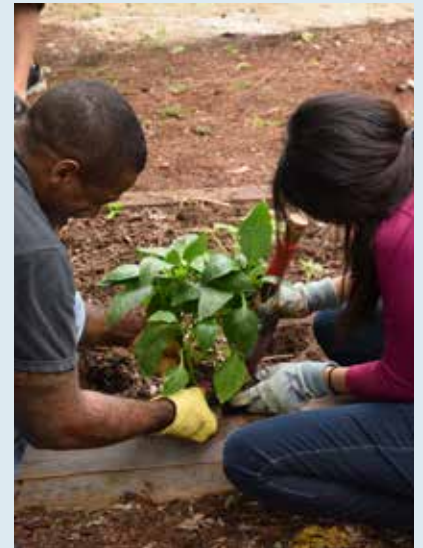
Gardeners (top and bottom images) learn and give back to the community.

On Oct. 9th in the East Side Community Garden, 150 nutrition students began the college's second season of sharing knowledge as guests in the garden. The project occurs with three to four student volunteers working independently most days of the week through the semester, but Oct. 9th was a day for all 150 currently enrolled nutrition course students to be present as volunteers. The students prepared soil, planted, pruned, and worked with mulch in the 6,500 square-foot garden where seniors can take their gardened produce home for meals.