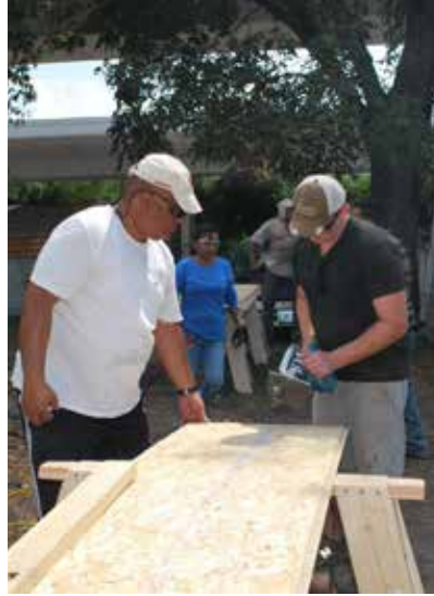
Construction technology students (top and bottom images) use skills to repair the home of an elderly couple.