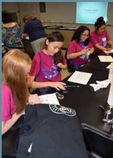
Students attend workshops led by professional women in the science, technology, engineering and math (STEM) fields.

SPC promoted future economic security for 150 local girls in grades 8–12 in the college's 2015 Women Breaking Through Conference on Oct. 10th hosted by the Center of Excellence for Mathematics. Conference highlights included workshops led by professional women in the science, technology, engineering and math (STEM) fields. Designed by current professional women to instill confidence in potential professional women, the workshops allowed teenaged girls to explore technology, chemistry, nanotechnology, applied mathematics, molecular biology, and science.