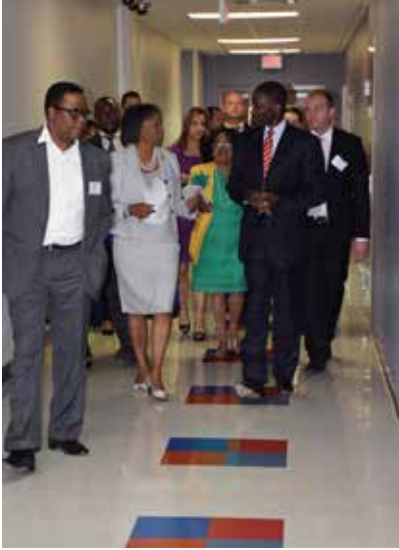
The foreign investment entourage tours the Center for Health Professions.