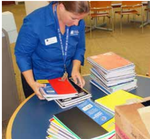
The new notebooks and pencils (above) were donated by faculty, staff and students at the college.

Faculty, staff, and students contributed to a multi-campus school supply donation drive benefiting Bowden Elementary School students by delivering school supplies for back to school success. Organizers at SPC and the elementary school determined that Bowden Elementary students required new 70-page wide-ruled notebooks, pencils,