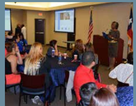
Students gave back while presenting research on autism and food allergies in the Bowden Alumni Center.