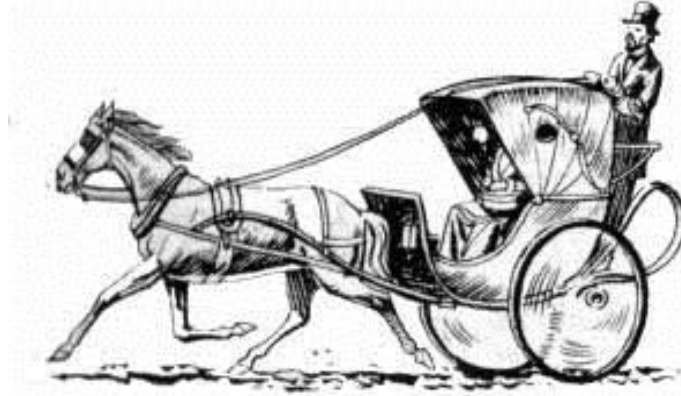
Joseph Hansom's cabriolet

In Hong Kong one might hail a rickshaw , in Kiev a droshky , in the United States a cab, and anywhere else in the Western world a taxi.