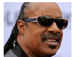
Stevie Wonder, an American musician, suffered a condition that made him blind.