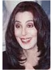
Cher is a singer and actress who is diagnosed with dyslexia.