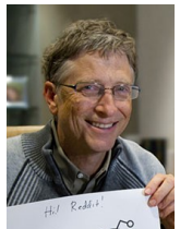
Bill Gates, founder of Microsoft Corporation, is diagnosed with Autism.