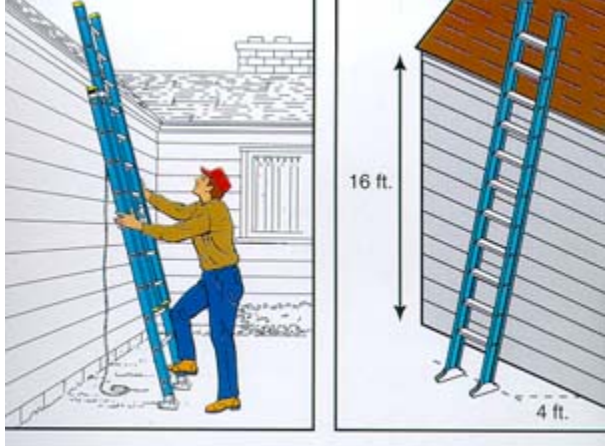
Use the 4-to-1 rule when setting up a ladder.

feet of the ladder should be 4 feet from the wall. If you are going to climb onto a roof, the ladder should extend 3 feet higher than the roof. The upper and lower sections of an extension ladder should overlap to provide stability.