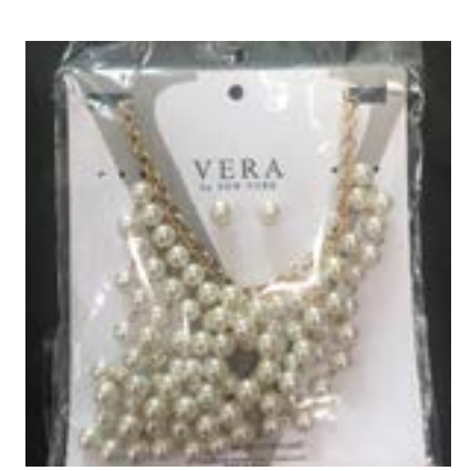
Necklace With Earrings