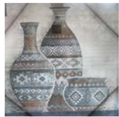
3 Vases Picture