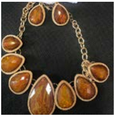
Earring Tiger Colors