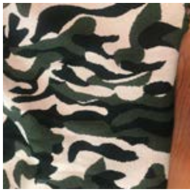
Camouflage Long Cardigan