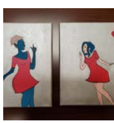
Red Dress Paintings