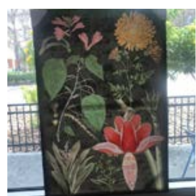
Flowers Dark Backgound