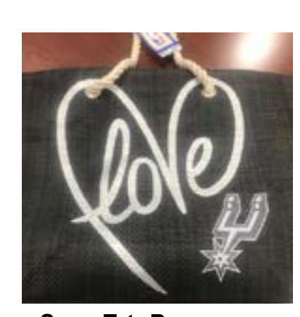
Spurs Tote Bag