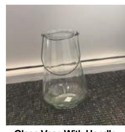
Glass Vase With Handle