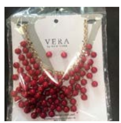
Necklace With Earrings